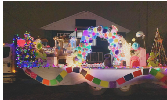
2021 Holiday Parade